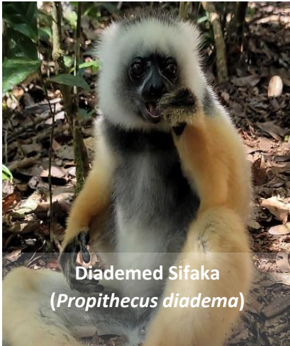
Diademed Sifaka ( Propithecus diadema )

Lot IJF 87 BIS Ambohimarina-Ambavahaditokana Itaosy 102 Antananarivo MADAGASCAR Tel : 00 261 34 14 31929 / 00 261 34 27 29793 E.mail : contact@nature-culture-madagascar.com / ncm.madagascar@gmail.com http://www.nature-culture-madagascar.com