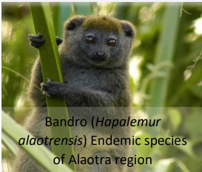
Bandro ( Hapalemur alaotrensis ) Endemic species of Alaotra region

From January 01 st 2025 to December 2025