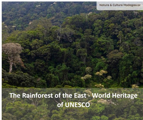
The Rainforest of the East - World Heritage of UNESCO